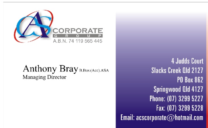
Business Cards front & back